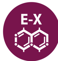
SULFUR DIOXIDE AND SULPHITES